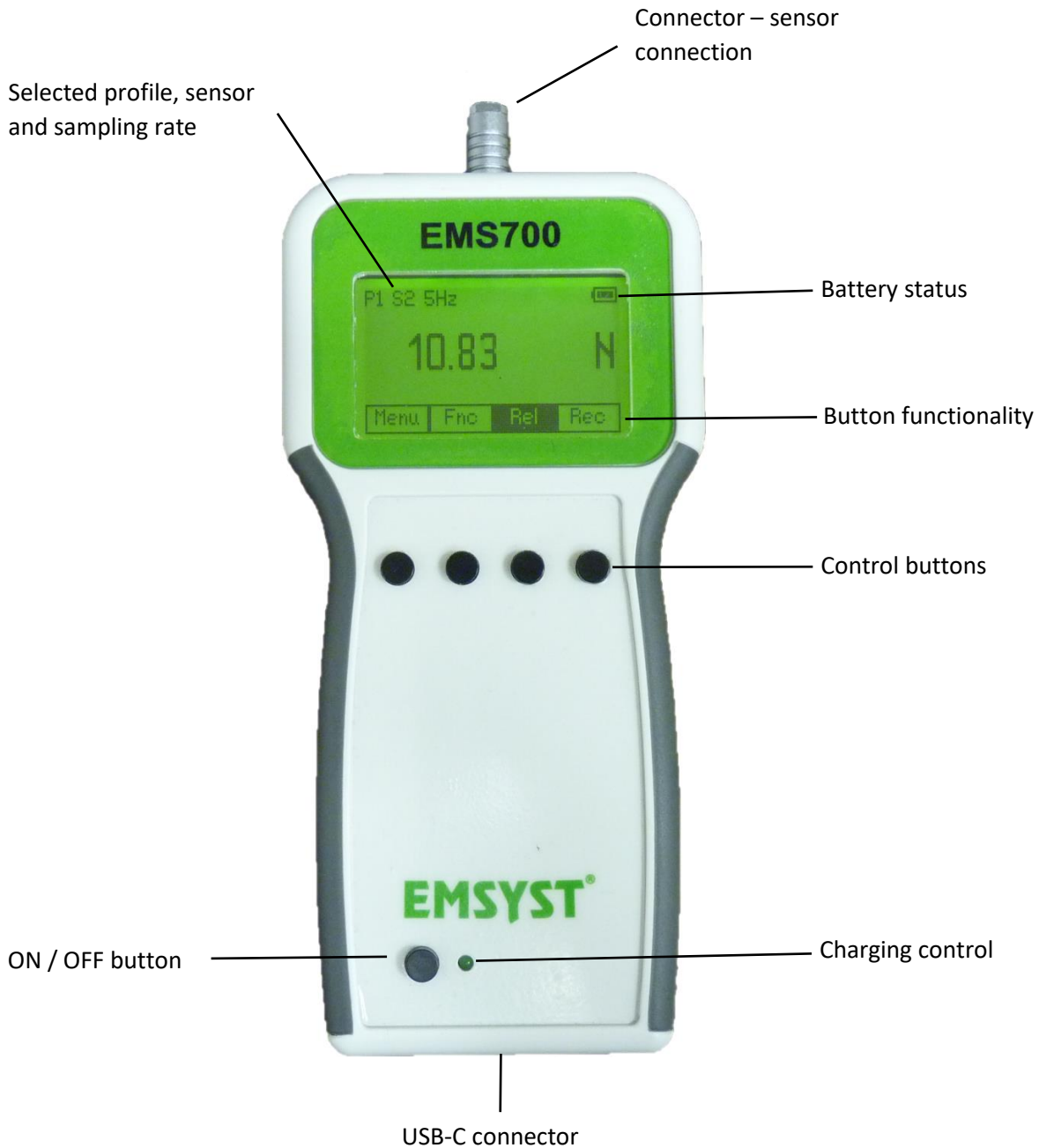
Fig. 1 EMS700 device

The EMS700 device is intended for processing signals from force sensors, moment sensors or other sensors working on the principle of a resistance bridge. It has a built-in powerful battery that enables long-term measurement in the field. Together with a suitable sensor, it is mainly used for checking force settings on machines, portable weighing, pressure measurement, etc.